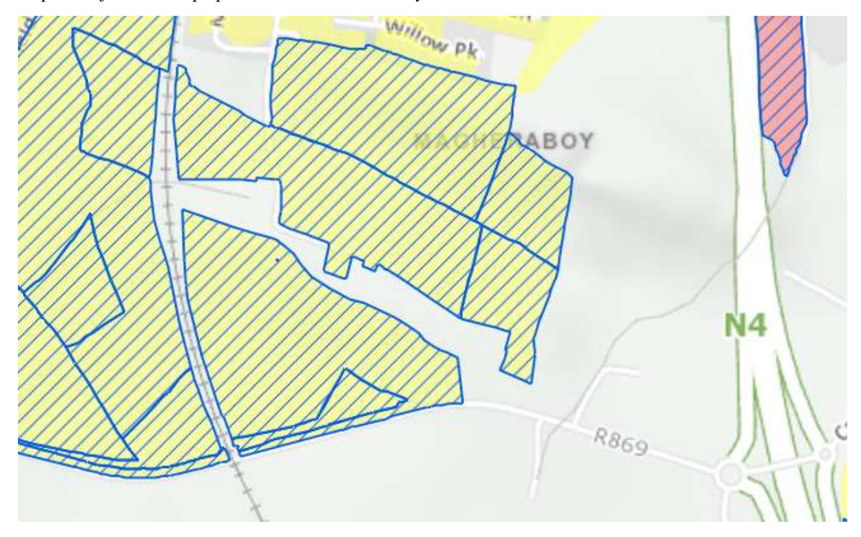
Appendix 1: As per draft RZLT maps published on 1<sup>st</sup> February 2024.